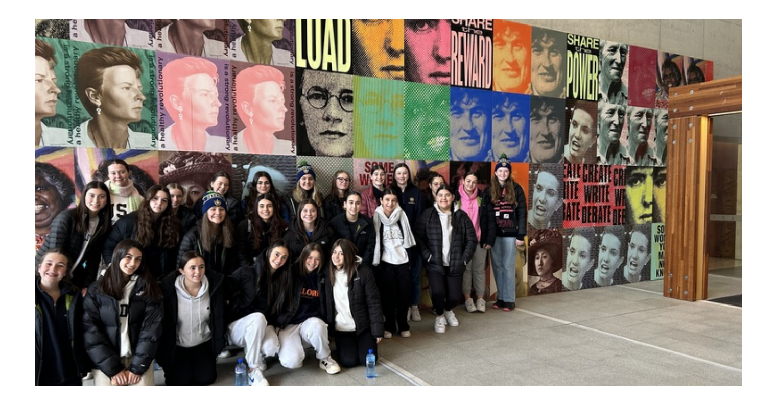
Flinders University STEM Enrichment Academy for Girls