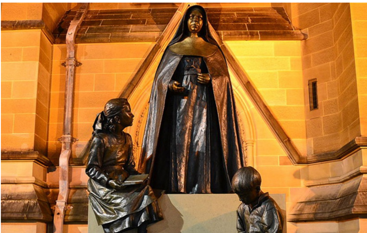
Prayer to St Mary of the Cross MacKillop