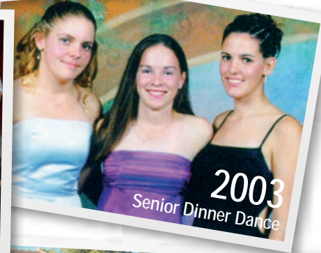
2003 Senior Dinner Dance