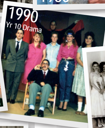
1990 Yr 10 Drama