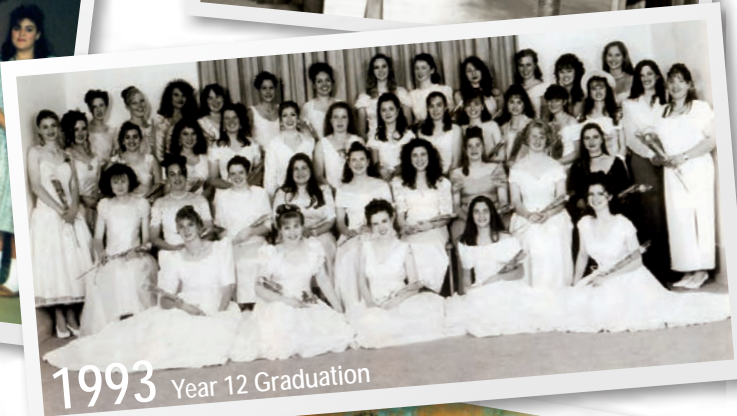
1993 Year 12 Graduation