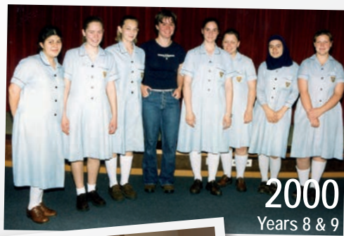
2000 Years 8 & 9