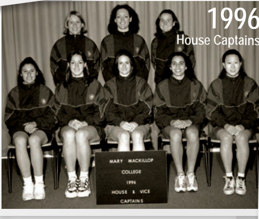
1996 House Captains