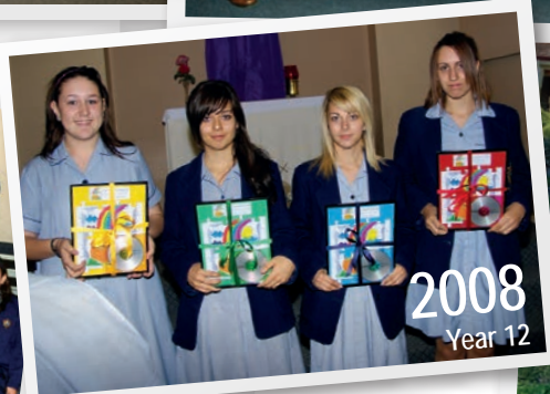
2008 Year 12