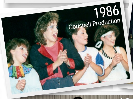
1986 Godspell Production