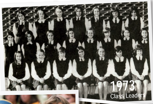
1973 Class Leaders