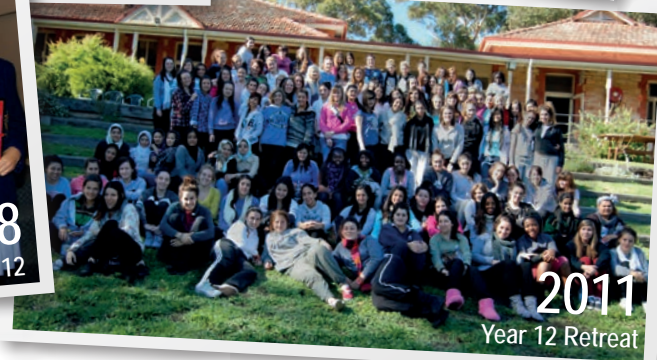
2011 Year 12 Retreat